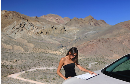
If You Are An American Born Between 1936 and 1966 Check This Out EverQuote