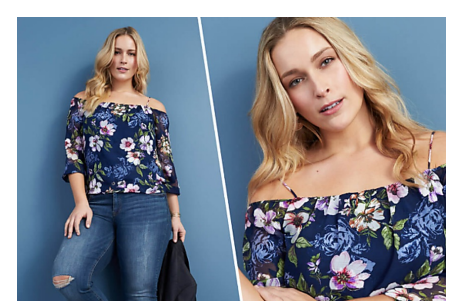
10 Things to Do When You Try Stitch Fix Stitch Fix