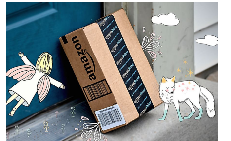
This Genius Google Chrome Add-On Is Saving Amazon Shoppers a Ton of Cash