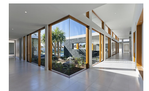
Sell Your Home Faster And For 15% More Homelight