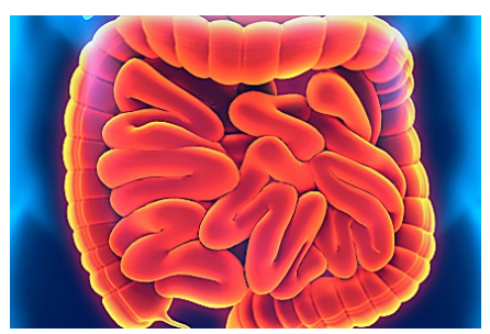
Intestinal problems – what can really help Health-daily