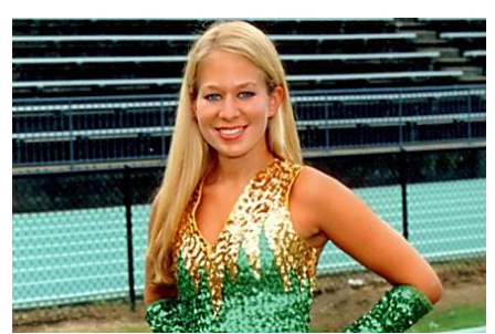
Teen Goes Missing In Aruba. But 10 Years Later, Police Uncover Truth